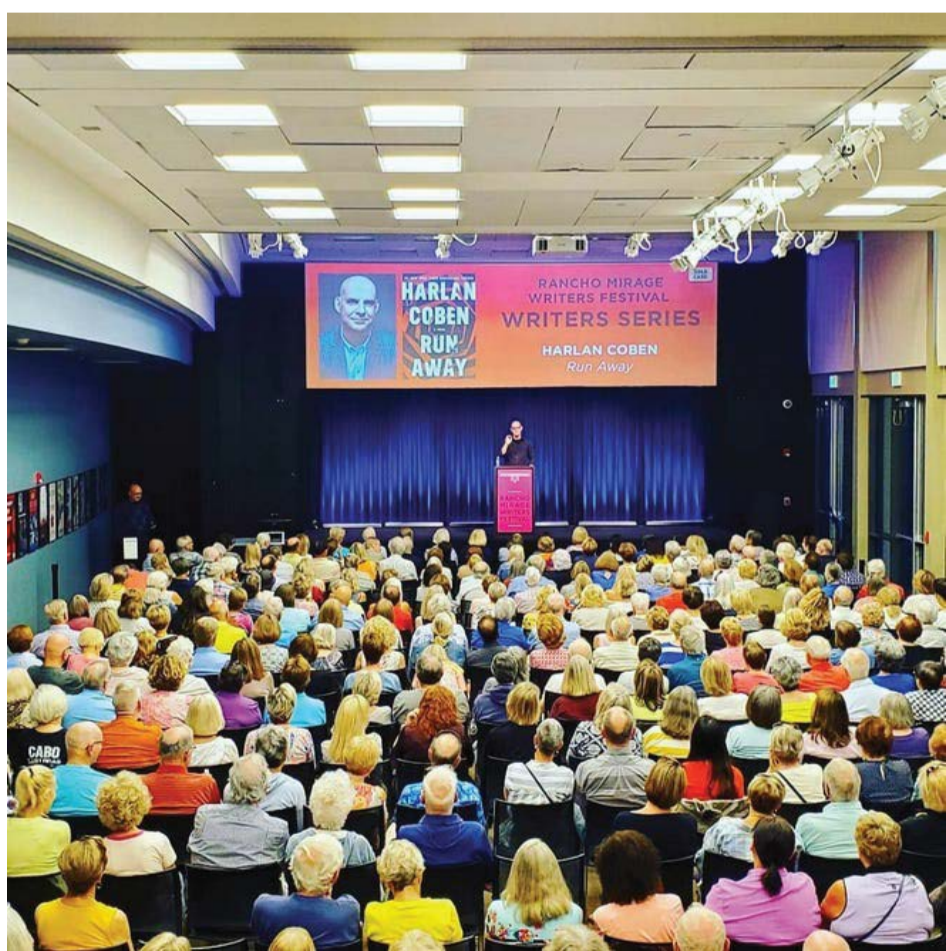
Author Harlan Coben spoke in April 2019.