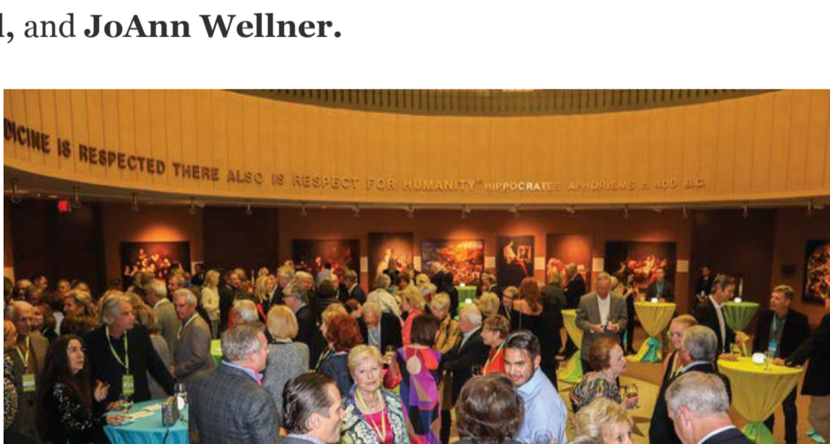
Crowd at Eisenhower