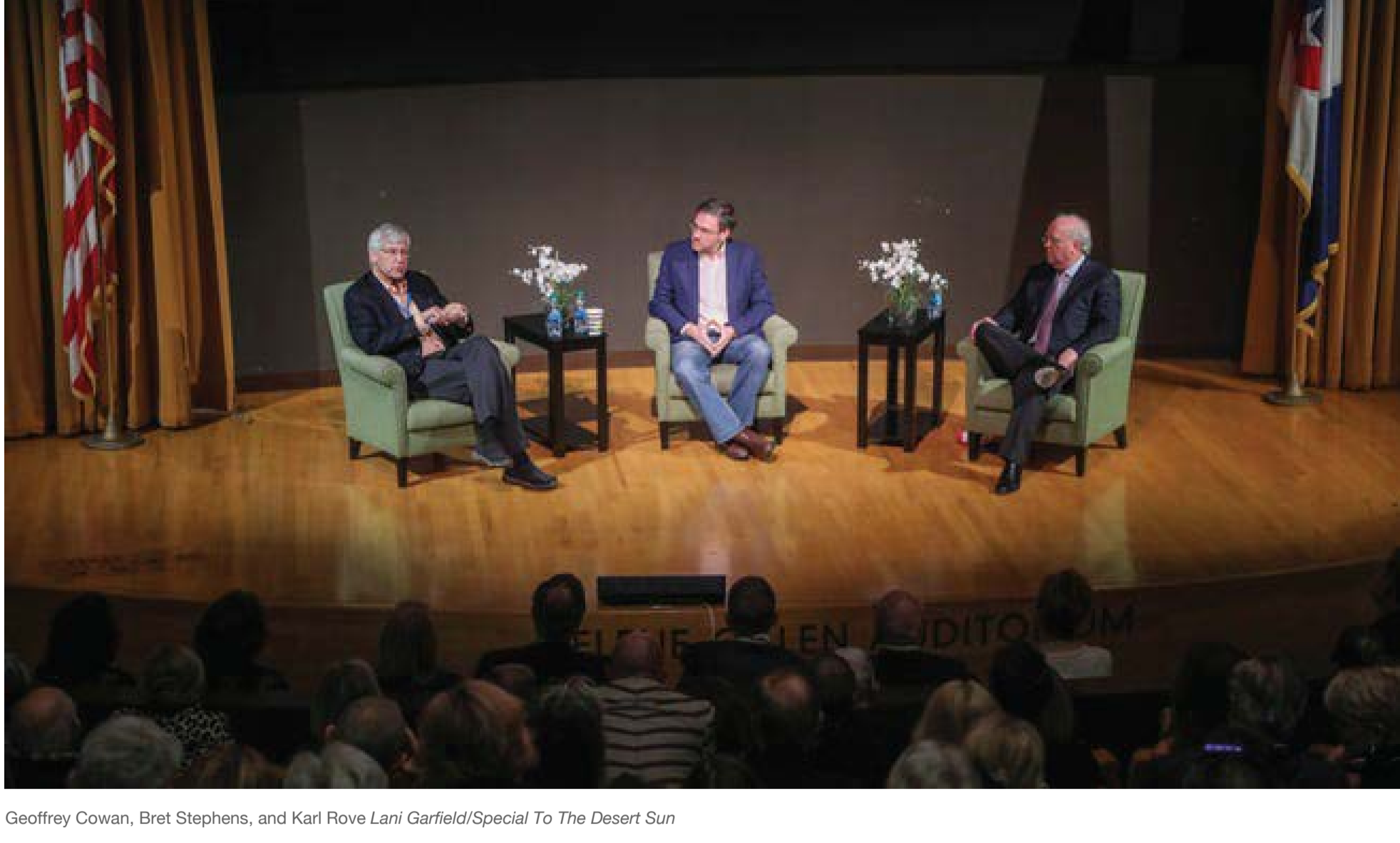
Geoffrey Cowan, Bret Stephens, and Karl Rove

Published 10:00 a.m. PT Feb. 3, 2018 | Updated 3:26 p.m. PT Feb. 6, 2018